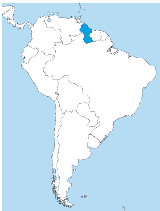
A map of South America showing the location of Guyana